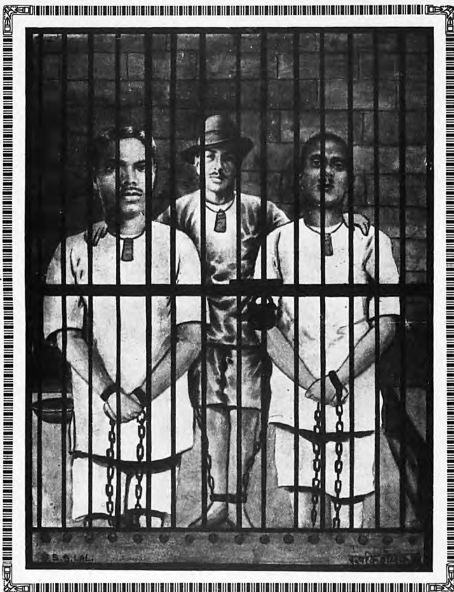
Raj Guru. राजगुरु